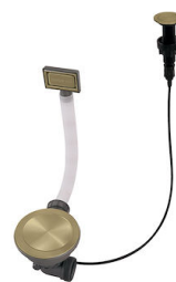
VIDAGE FADE PUSH GOLD A407 A21