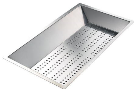
CUVETTE PERFOREE POUR EVIERS RIVA A156 F00